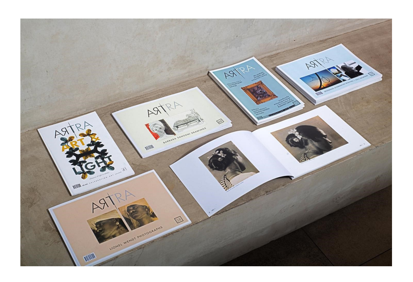
Art on Table Tops